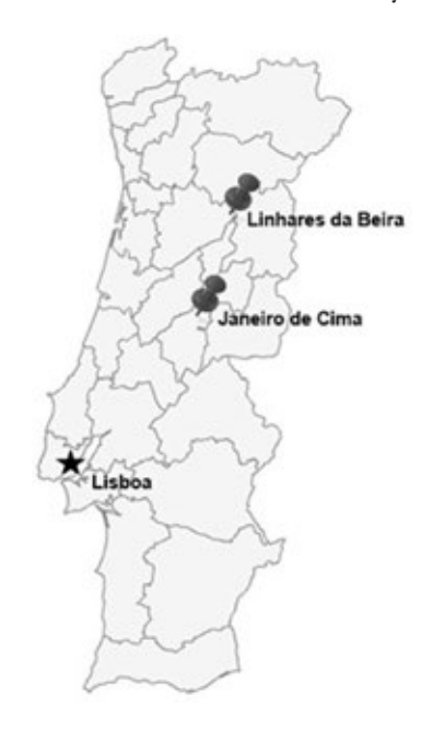
FIGURE 2 - Location of the case study villages

information office. The number of visitors are above 10 000 visitors a year, which is remarkable for a village of the size of Linhares, although numbers were well above 20.000 visitors between 2002 and 2004, revealing some decrease of attractiveness in the past years. Most visitors are excursionists staying for just a few hours to visit the castle and its surroundings. The domestic market clearly stands out (representing more than 89% of the total market), although the share of international tourists increased from 8%, in 2005, to 11% in 2009 (AHP, 2010, CMCB, 2005).