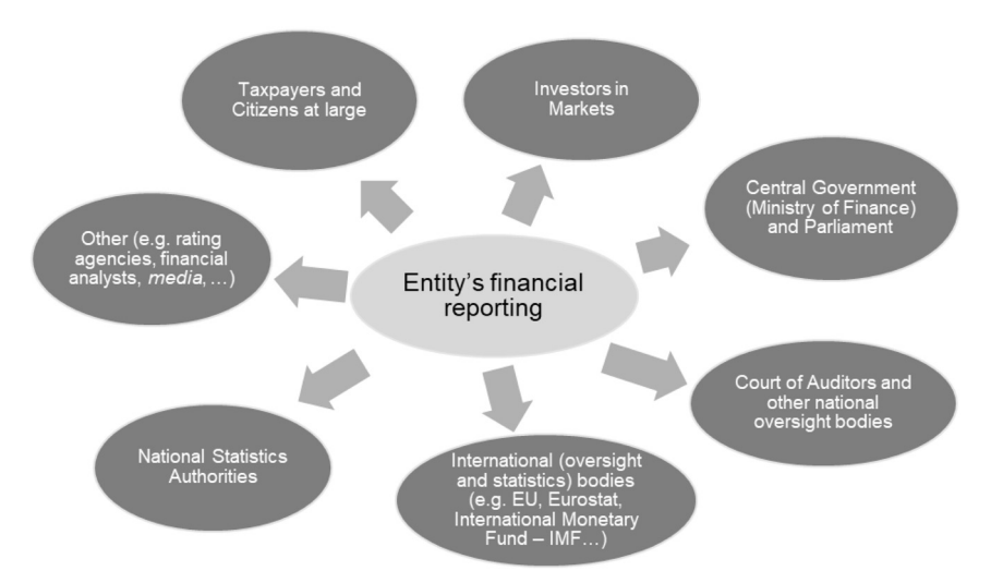
Figure 9.1: Setting of public sector entities' financial reporting

The widely diverse nature of the stakeholders presented for the public sector financial reporting may lead them to give importance to different issues and different types of information within the GPFR; there might also be some specificities – e.g., Government Financial Statistics use information from GPFR as input to prepare macro/supranational reporting.